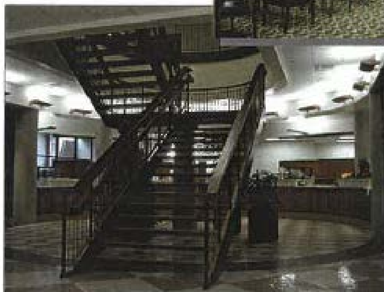
First floor lobby featuring a grand staircase open to the second floor.